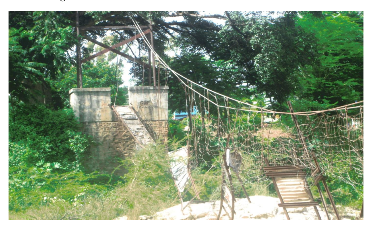
Picture: Colonial Hanging bridge crossing the river Mkondoa in Kondoa town.

• Hanging Bridge in Kondoa Town This bridge was built in 1916 by German troops led by General Van Deventer during The Battle of Kondoa Irangi. It is attractive for tourism activities to both local and international Tourists ,Public Institutions, researchers, public employees and the whole community at large.